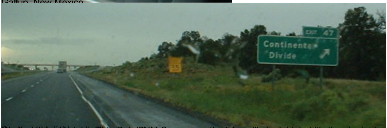
Continental Divide, near Tinto, Pahr DNM. Canyon south of Amarillo tonight, but it's time for bed so