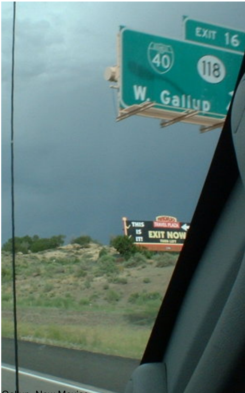
Gallup, New Mexico

Wednesday, 06 August 2008 01:50 - Last Updated Thursday, 14 August 2008 08:27